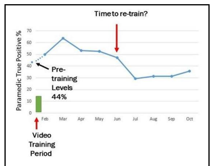
Figure 1: Monthly percentages of pre-hospital stroke recognition by paramedics. Pre- training recognition rates of 44% increased by 19% in the second month following training. By the fifth month (July) the rates were declining to pre-training levels.

The paramedics correctly identified stroke transports (Table 2) with a sensitivity of 56.1% [IQR 46.2-65.7] and a positive predictive value (PPV) was 43.1% [IQR 36.6-50], however their diagnostic accuracy was 98.5% [IQR 98.3-98.8] due to the low prevalence of the disease among all transports. The rate of true positive recognition by the month following video dissemination is shown in Figure 1. Recognition increased by 5% during the month of training and an additional 14% by the second month but then gradually declined to baseline or lower at 35.7% within four months.